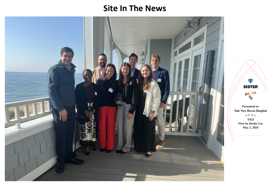
Yale with 1st Enrollment Trophy

Hope your Thanksgiving is full of peace and gratitude!